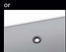
or Calendar without hanger (straight header)