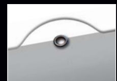
Calendar with hanger ...

Thereby, the transparent carrier film for the date cursor is slightly coloured, harmoniously coordinated with the colour of the previous and following months of your advertising calendar.